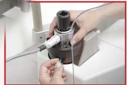
Quick Release Pins make changing transducers a snap

Part Number 5000-3 consists of the following: