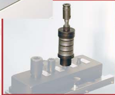
Joint Rate Simulator