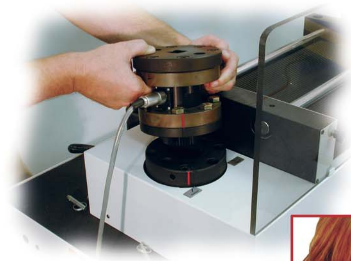
Easy, quick change transducers.