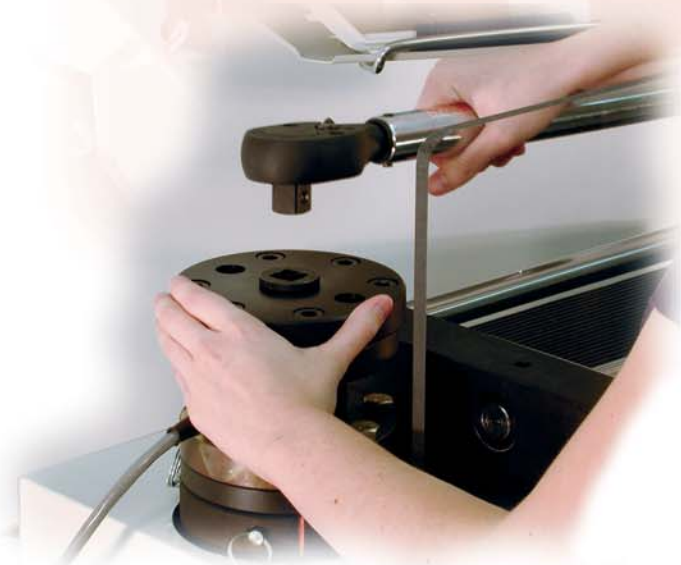
2000 ft. lb. Transducer