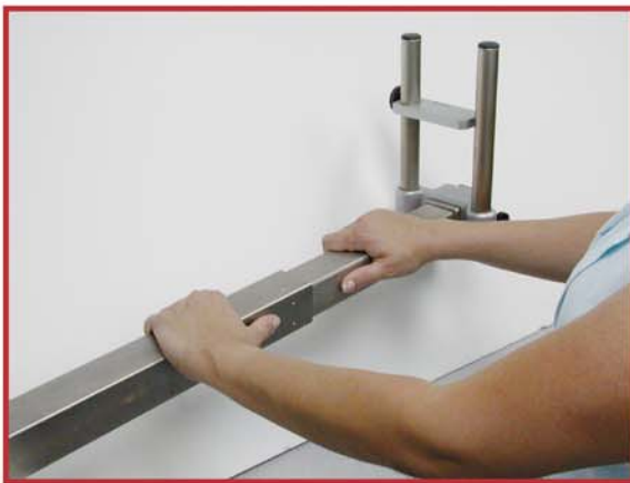
Telescoping Arm extends to accommodate 600 ft. lbs. wrenches