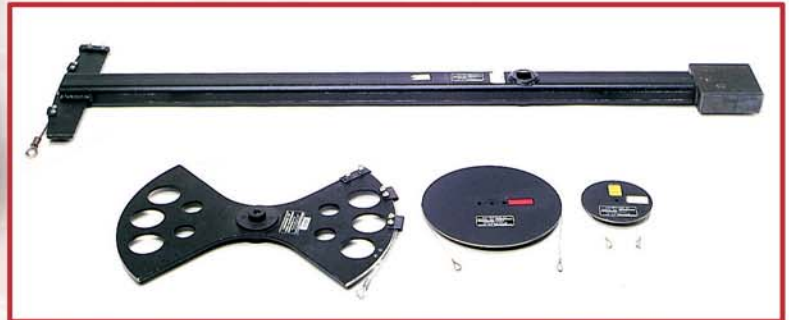
Calibration Arms and Wheels