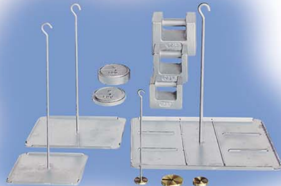
Calibration Weights and Trays